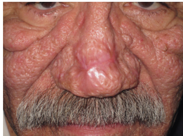
Figure 3. 8 months post-op.

The patient tolerated the procedure well and was closely followed during the postoperative period for dressing changes. The skin reepithelialized completely over the ensuing several weeks. At a 4-month follow-up visit, a scar was present on the nasal dorsum, but the overall nasal contour was restored and his nares were patent (Figure 3). The patient was extremely happy with the final outcome. He repeatedly stated that he no longer avoided social interactions and would go out of his way to be in