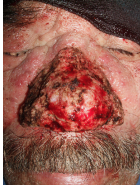
Figure 2. Immediately following rhinophymectomy with Shaw scalpel.

The procedure performed was similar to one that Eisen and colleagues described. 3 The anterior ethmoidal nerve was blocked bilaterally with 1% lidocaine with 1:1,00,000 epinephrine. Additional anesthesia was achieved using a ring block around the entire nose. A Shaw scalpel with a #10 blade was set to a temperature of 160°C and used to debulk hyperplastic tissue and contour the nose to the desired shape (Figure 2). Old photos of the patients were used as a guide to establish his baseline nasal contour. Gauze soaked in 1% lidocaine with 1:1,00,000 epinephrine was used topically for further hemostasis before dressing application. A pressure dressing to the entire nose was left in place for 2 days.