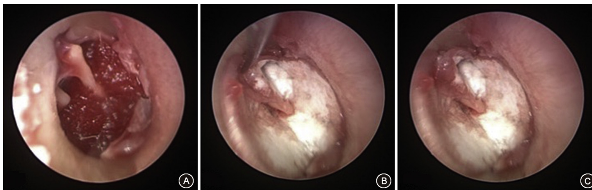
Fig. 5 Endoscopic lateral graft tympanoplasty. A: Endoscopic view of the de-epithelialized tympanic annulus and medial canal wall, with Gelfoam in the middle ear cavity. B: SIS in lateral graft position, with notch cut to fold around malleus manubrium. C: Final endoscopic view of the SIS lateral graft in place.

deformities of the graft in this area. These fine and precise notches can be readily created in SIS. Posteriorly, a notch is cut to accommodate the malleus manubrium. Once positioned, several squares of split thickness skin graft are placed laterally to the SIS graft (Fig. 5).