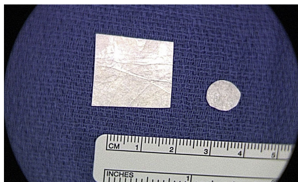
Fig. 2 Biodesign small intestinal submucosal graft in a square and cut into a disk.

This technique is typically used in our group for perforations which are larger or abutting the tympanic annulus, but still small enough and located favorably on the drum to allow for an underlay of the tympanic membrane remnant. After injecting the canal with 1% lidocaine with 1:100,000 epinephrine, the perforation is freshened circumferentially with a gently curved pick and cup forceps. A tympanomeatal flap is then elevated with a Rosen knife or 20 gauge suction protected with 1 mm × 1 mm square of polyvinyl acetyl sponge (Fig. 4). The tympanic annulus is elevated out of its bony groove and the middle ear is inspected. If the margin of the perforation extends to the malleus, the long process of the malleus is skeletonized from the short process to the umbo. If there is adequate overhang of the drum around the malleus, then the remnant is left attached to the malleus. At this point, the perforation is measured and a sheet of SIS is cut to size, and designed to extend beyond the perforation by at least 1 mm on all