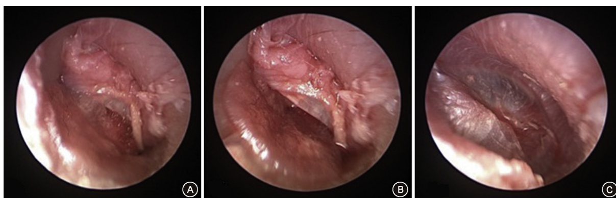
Fig. 4 Endoscopic underlay tympanoplasty. A: Demonstrates an endoscopic view of the elevated tympanomeatal flap with Gelfoam placed into the middle ear cavity. B: Positioning of the SIS graft under the tympanic membrane. The flap is then folded back over the graft. C: The final view of the repaired tympanic membrane.

sides, and to extend up onto the bony canal wall if the perforation is marginal. A slit or notch is cut into the graft to accommodate the malleus long process. It is critical when measuring the graft and cutting the notch or slit to consider how far the side opposite the notch will extend when the notch is snugged against the manubrium. As this can be maneuvered up to the malleus short process before meeting resistance, care must be taken that the graft will not be too short in its inferior and posterior extent after positioning against the malleus. An advantage of SIS is that if the graft is found to be inadequate in size, there is usually ample material from the 2.5 cm × 2.5 cm sheet to create a second graft of adequate size. An additional benefit is that the uniform thickness and consistency of the graft allows for precise trimming and placement of notches or slits to accommodate the 3-dimensional shape of the drum remnant, ossicles, and canal. After graft placement, the tympanomeatal flap is returned to its anatomic position. The drum can then be covered laterally with a very thin split-thickness skin graft, a layer of gelatin sheeting (Gelfilm, Upjohn, Kalamazoo, MI), a hyaluronic acid sheet (EpiFilm; Xomed-Medtronic, Jacksonville, FL, USA) or Gelfoam. Bacitracin ointment is then placed laterally in the ear canal.