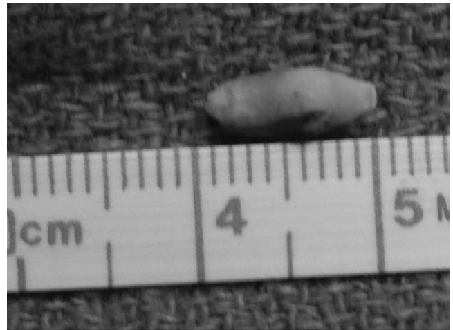
Fig. 2. Submandibular stone measuring 9 × 3 mm—endoscopic removal successful.

Salivary gland stones may vary in size and shape. The size of the stone can vary from 2 to 2cm, with the mean size being 3.2 and 4.9 mm for parotid and submandibular stones, respectively [4,5]. In our series, the mean size of the stones ranged from 2 to 1.2 cm with an average of 4.5 and 4.4mm for submandibular and parotid stones, respectively. Salivary stones tend to grow at a rate of 1 mm/y [6]. Marchal [5] reported that 97% of stones smaller than 3 mm could be retrieved with the wire basket; however, success rates were dismal at 35% for larger stones. Marchal and Dulguerov [1] suggested an algorithm for stone removal, which is widely accepted, the recommendation being that stones less than 4 mm in their maximum diameter within the for submandibular gland and less than 3 mm within the parotid gland are amenable to endoscopic removal. Larger stones required prior fragmentation [1]. Nahlieli et al [3] recommended that intraductal extraction was possible for stones less than 5 mm in diameter. Although there may be differences in experiences regarding the optimal cutoff for when endoscopic extraction is considered feasible, there is a universal agreement that the largest diameter of the stone determines the approach for endoscopic removal of sialoliths. There is also a consensus that larger stones require an alternate approach which could be either prior fragmentation or a combined technique for removal.